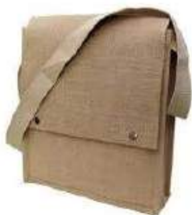
VDL.JT. OF 01