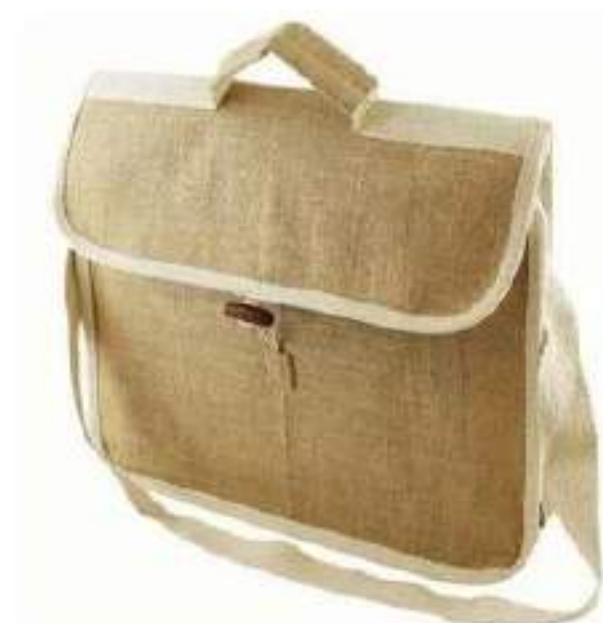
VDL.JT. OF 02